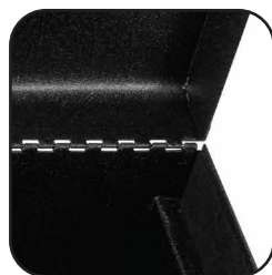
EASY ACCESS Piano Style Hinge