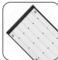
VERSATILE Built-in vented nylon seaming plate on bottom of tray