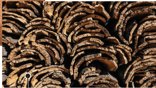
CORK REMOVED FROM TREES