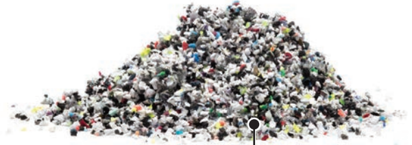
RECYCLED EVA FOAM