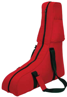
CONVENIENT Nylon carrying case included