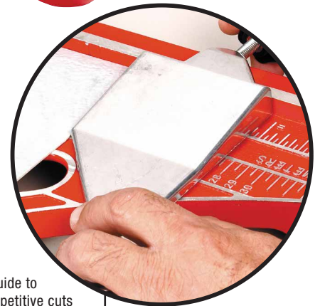
CONSISTENT Moveable cutting guide to make consistent, repetitive cuts easier with 45° miter guide