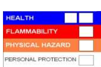
HMIS & NFPA Hazard Rating